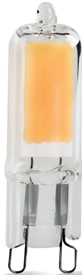
G9 GLASS LED2W-WW