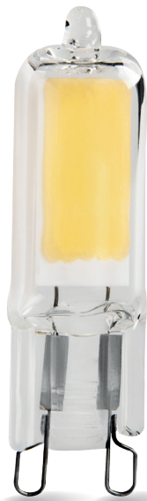
G9 GLASS LED2W-CW