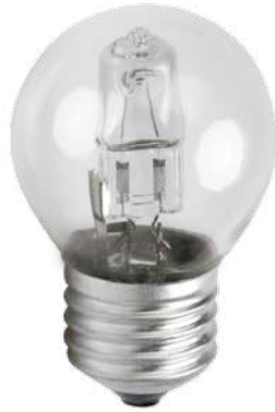
MGH/CL 28W E27