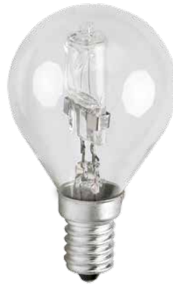
MGH/CL 28W E14