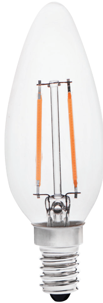
ZIPI FILLED 2W E14-WW