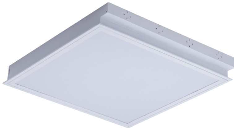
REGIS 3 OPAL 418 PT