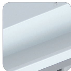
powder coating pulverbeschichtet